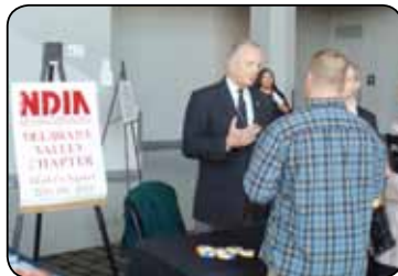
NDIA-DVC provided guidance & support

The networking and resource center was designed to support veterans in their career search by connecting them to individuals and organizations who could offer career development and placement services. There were approximately 112 visitors to the Center where informal career development talks were presented by the following key resource providers: