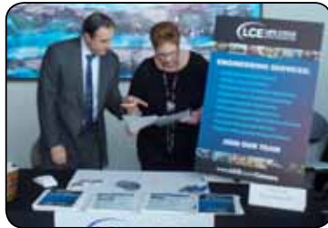
Life Cycle Engineering looking for good candidates