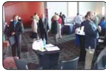
Networking & Resource Center

The networking and resource center was designed to support veterans in their career search by connecting them to individuals and organizations who could offer career development and placement services. There were approximately 112 visitors to the Center where informal career development talks were presented by the following key resource providers: