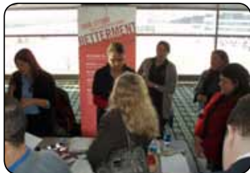
Day & Zimmermann had strong interest