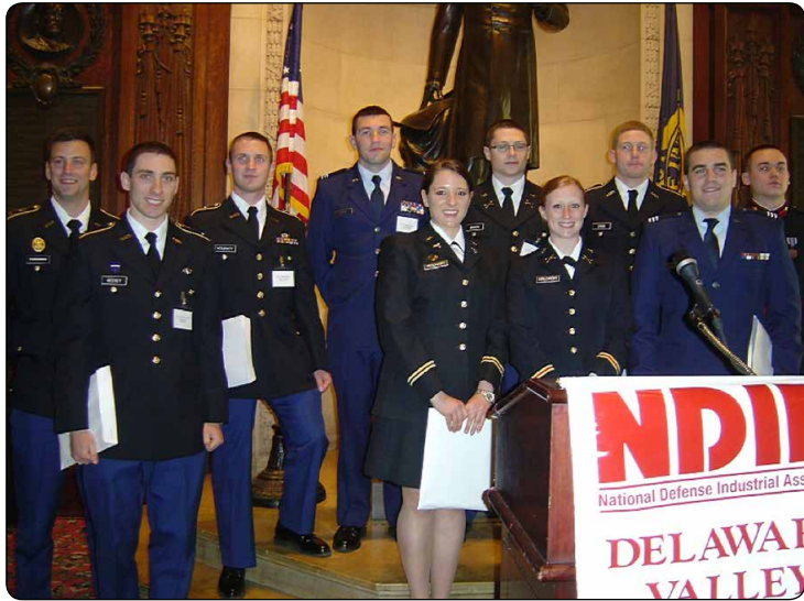
ROTC/NROTC Delaware Valley Recipients

This year's luncheon was multi-purpose as the Sidney Ross Award for technical, academic and personal accomplishment was awarded to a selected ROTC/NROTC honoree. Those receiving awards were: