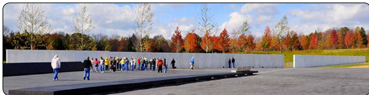
Flight 93 Memorial - Shanksville, Somerset County, Pennsylvania

During the Flight 93 recovery efforts in Shanksville, the workers mounted an American flag in a drag bucket of an old, abandoned strip mine that was hanging over the crash site. The twenty-two ton steel bucket has been re-forged into the bow of LPD-25, USS SOMERSET.