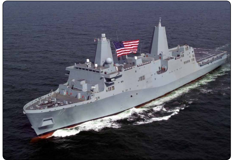
USS SOMERSET (LPD-25)

Feeling that they were on hallowed ground, yet afloat, they were able to see the well deck where the LCAC's, and in